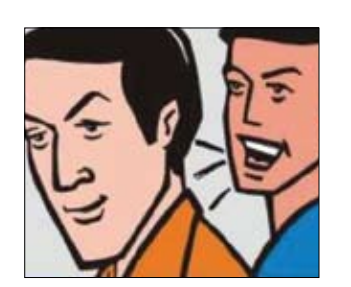
Noise-induced Hearing loss