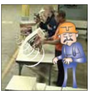
Assembly and Packaging